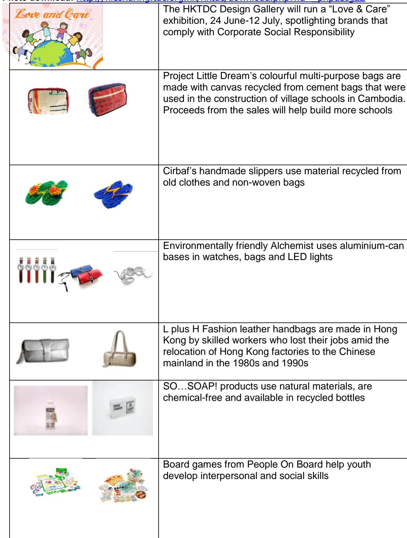
Photo download: http://filesharing.tdc.org.hk/hktdc/download.php?fid=_phpdSIq2Z