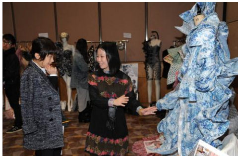
A finalist explains her collections to a juror