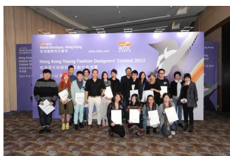
Judges and contestants pose for a group photo after the semi-final

Others: http://filesharing.tdc.org.hk/hktcdc/download.php?fid=_phpATwdM8