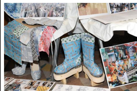
Fashion items from finalists